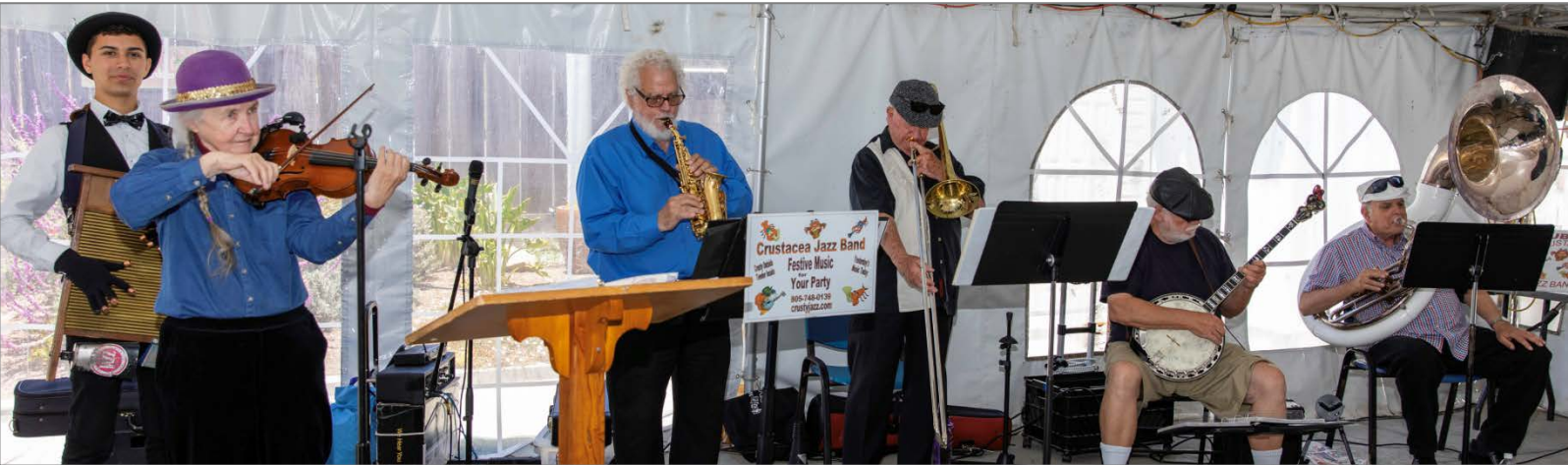
Crustacea Jazz Band entertains with great American Jazz music