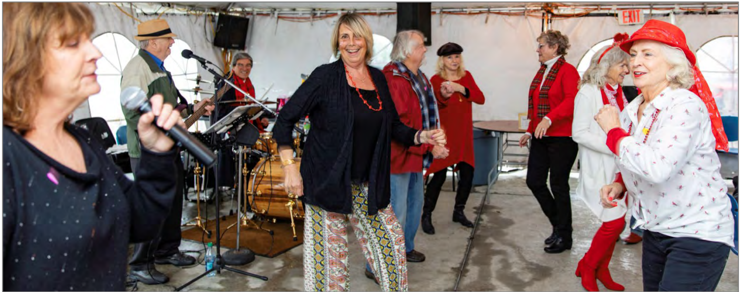
Everyone enjoyed the music of the Jazz Krewe