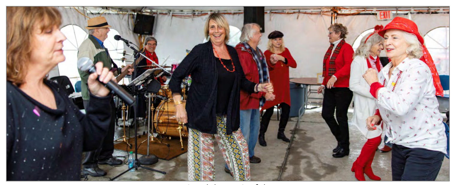
Everyone enjoyed the music of the Jazz Krewe