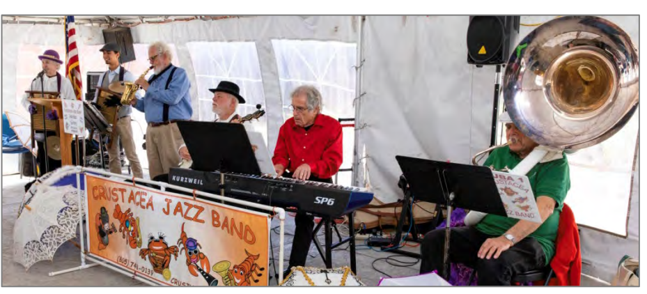
The Crustacea Jazz Band delivers another exceptional performance