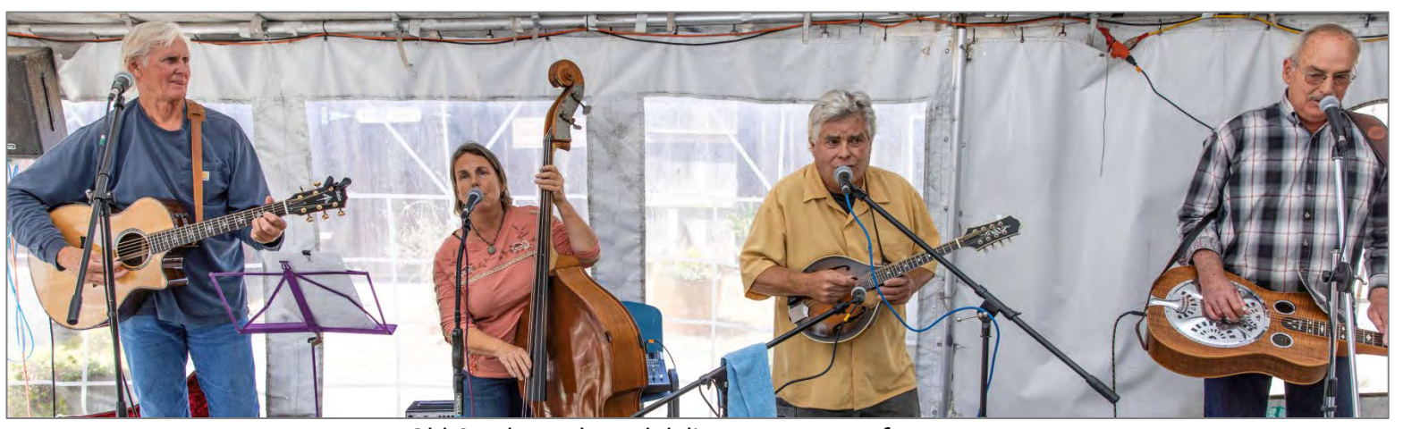
Old Creek Road Band delivers a great performance