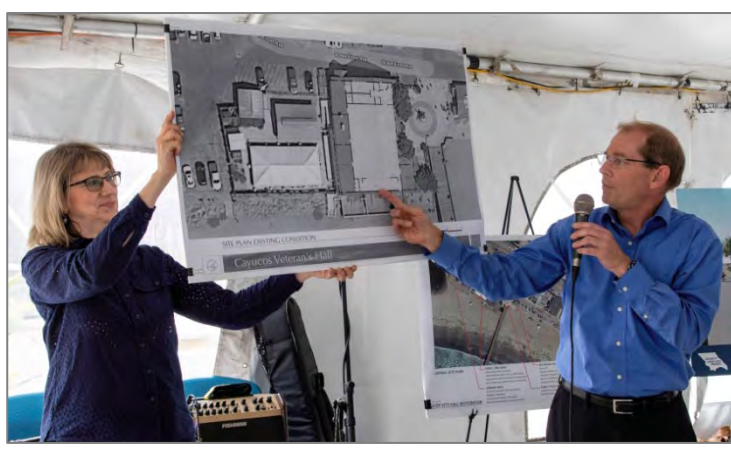
County representatives review plans for Vet's Hall Renovation ... it's going to be GREAT!!!